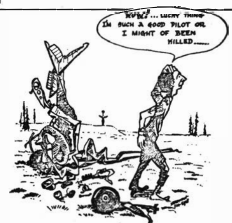
... WITH THE WRONG ATTITUDE!