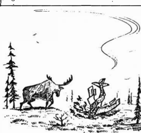
... WRONG ALTITUDE ...