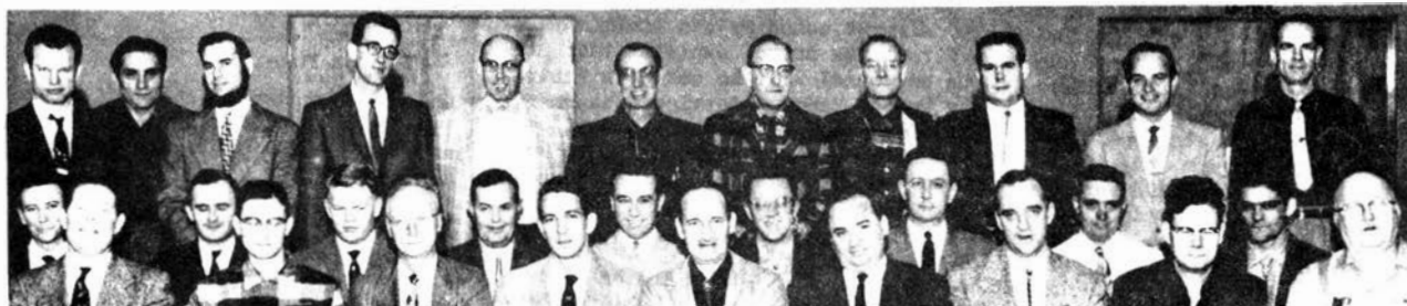
Seated Left to Right: