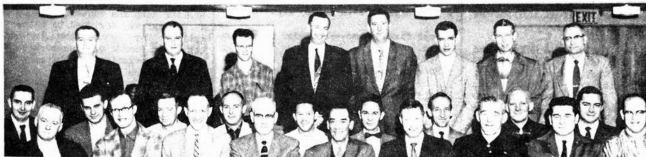
Seated Left to Right: