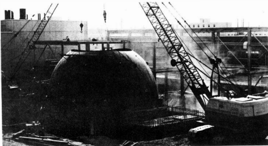
Cover for atomic reactor being built near Big Delta.

Big Delta will be the first FAA station to receive its electric power from an atomic reactor.