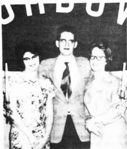
CAA youngsters at Cordova are leaders in Cordova High School's newly-formed "Aurora" chapter of the National Honor Society.