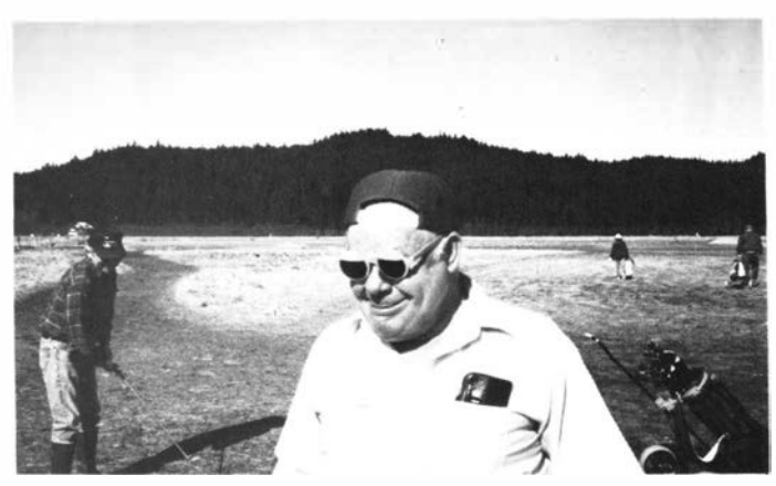
Getting psyched up for the first tee.

For weeks, the Juneau metropolitan community had been throbbing with anticipation. On the mind of everyone was — golf. The social and athletic event of the season was imminent.