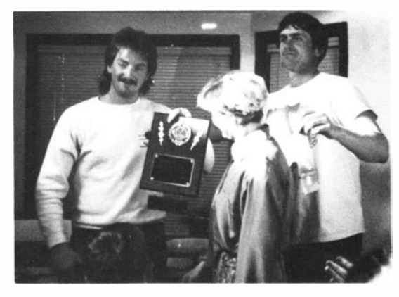
The winning team accepts the 1st place trophy.

effect on the bottom fish catch rate on the third fairway, it did allow a full nine holes to be played.