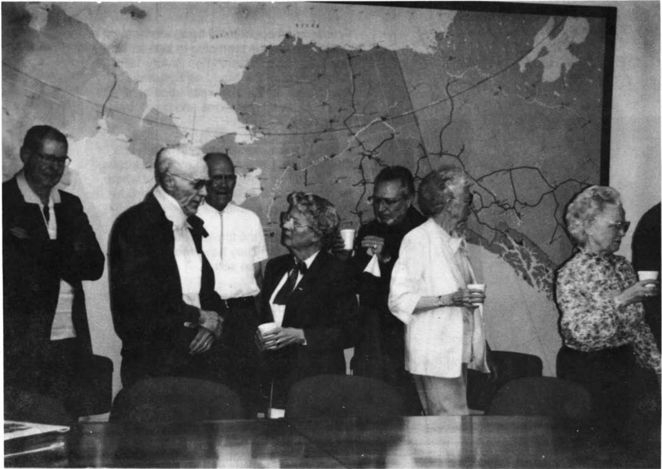
The Regional Office hosted the annual retiree get-together in the Anchorage Federal Office Building. Many of us enjoyed seeing all those familiar faces back at the workplace.