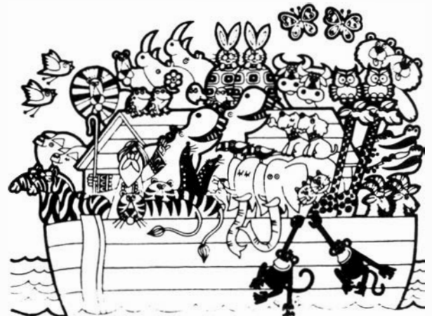
IS THIS THE WAY TO THE KENAI AFSS?

The happy ending to this story is that no one has been harmed, and so far most of our furry friends have only come by to visit and have a quick bite to eat. One thing to remember is that these are all wild animals and should be treated as such. A good closeup picture of Brother Bear or Mother Moose is certainly not worth a life or limb. It's much safer to go down to your local photo shop and buy a good picture to keep in that photo album or to send to mom or dad.