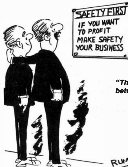
"That's right, it's the difference between profit and loss."