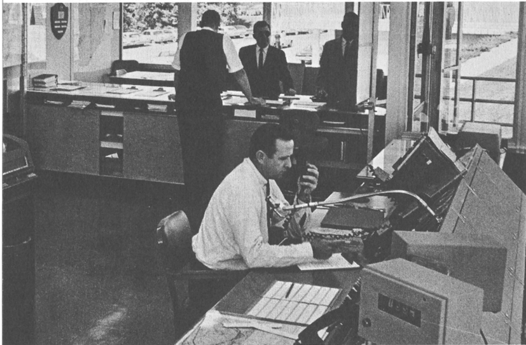
Specialists in FAA's 300 flight service stations primarily service the general aviation fleet of private, business and recreational aircraft by providing pertinent information on weather, airports, altitudes, and other flight-planning data to more than 700,000 pilots.

Candidates for air traffic control work are recruited locally at FAA field offices and trained at the Aeronautical Center in Oklahoma City. It is a career with a challenging future.